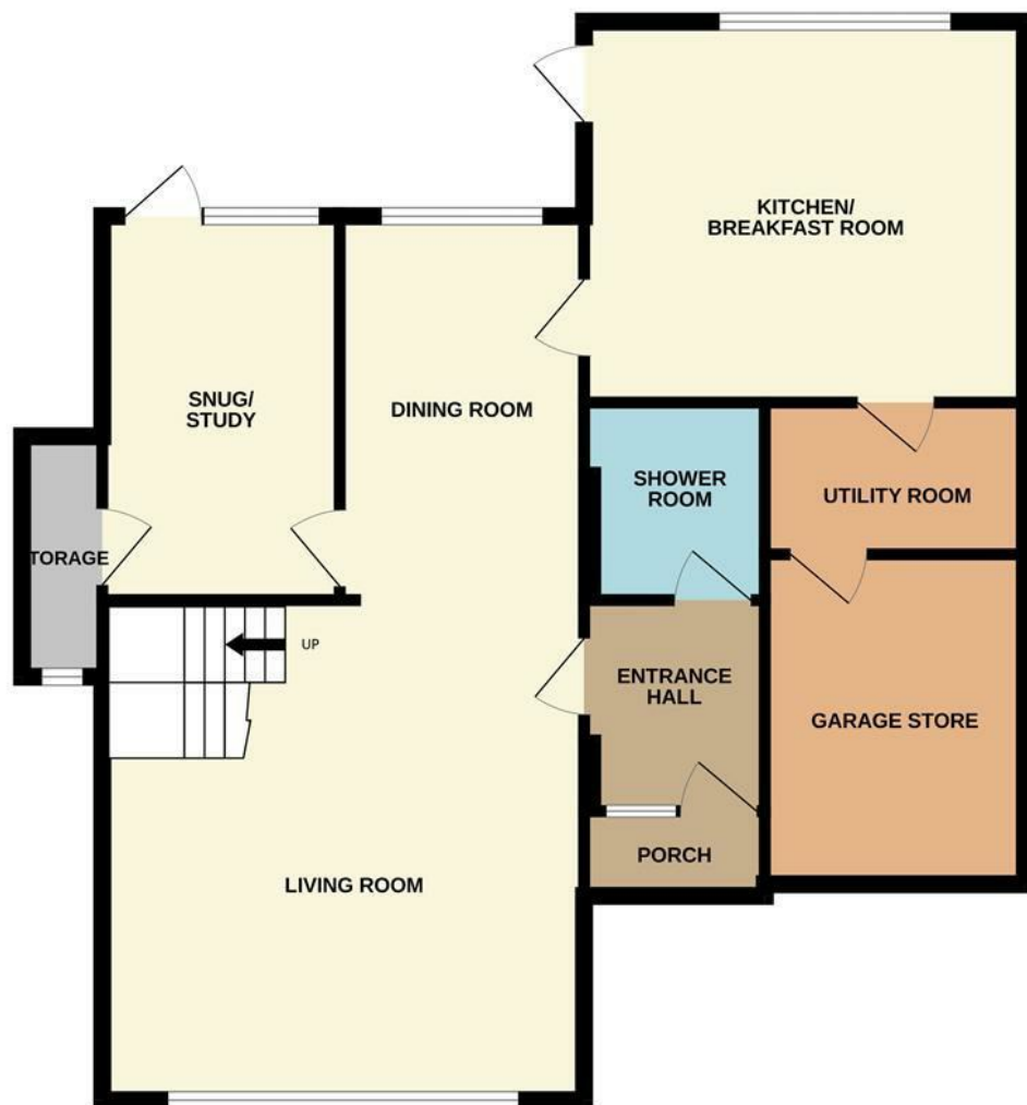
GROUND FLOOR 887 sq.ft. (82.4 sq.m.) approx.